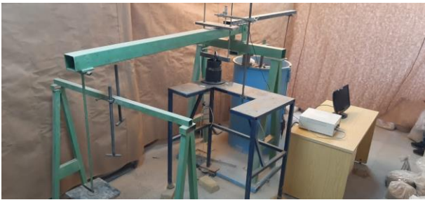
Fig. 1. Phase velocity dispersion curves for a steel pipe with outer diameter of 220 mm and wall thickness of 4.8 mm